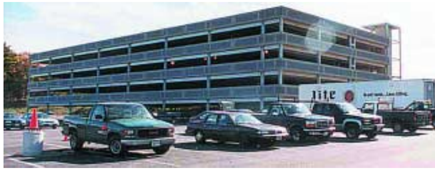
Hybrid framing allowed developer to meet scheduling budget.

The basic components of the HPS System are a structural steel frame combined with a pre-cast/pre-stressed concrete deck. The components are manufactured and tested off-site and delivered as a "ready-to-assemble" kit of parts. The structural steel frame is inherently stable and requires no external bracing. Steel columns and girders in the HPS "H" paired-column design provide structural support for the parking deck. Stable during erection, the steel frame resists seismic and wind loading without the use of shear walls. Because the pre-cast deck provides an impermeable and durable surface, prepared in a controlled factory environment and not compromised by variable field conditions,