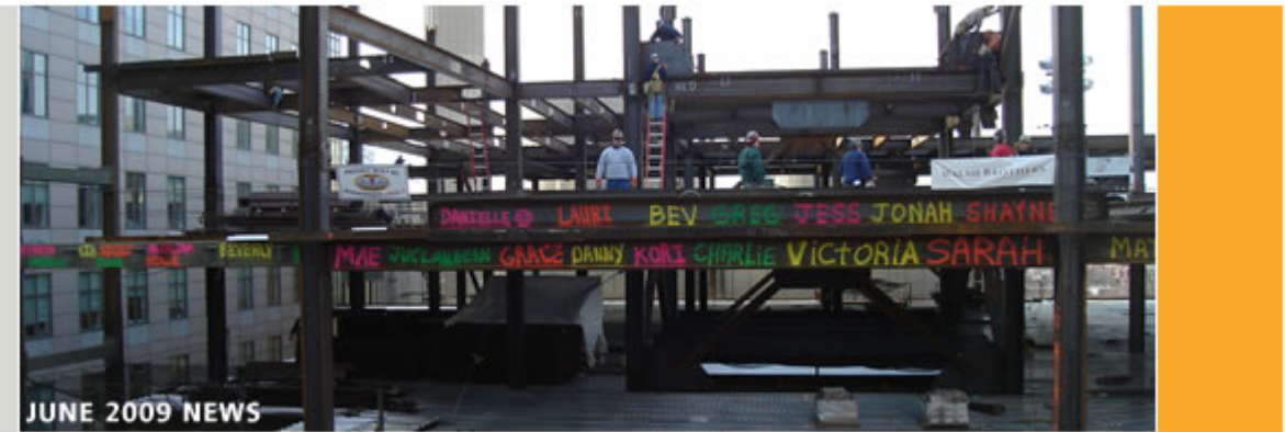
DANA-FARBER CANCER INSTITUTE YAWKEY CENTER FOR CANCER CARE • BOSTON, MA